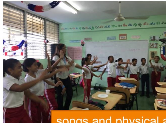
songs and physical action